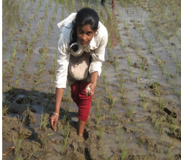
Urea-DAP Briquettes placed in paddy field by