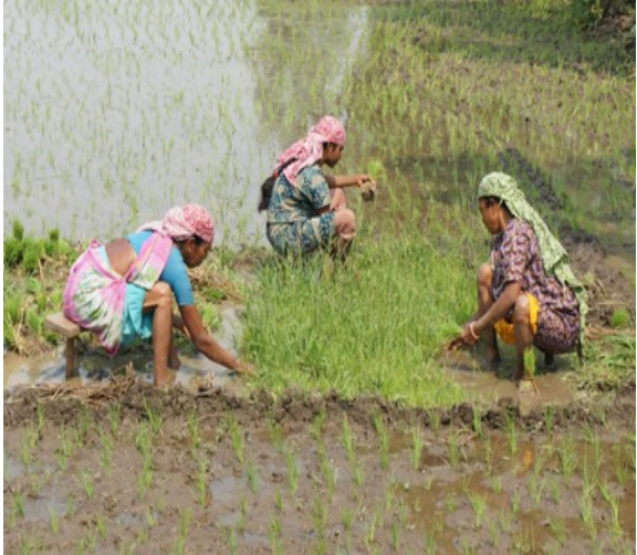
Uprooting of paddy seedling by farmers