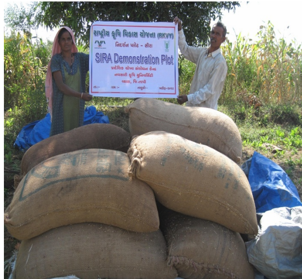
Farmer happy and got more grain yield paddy from SIRA Plot

Urea-DAP Briquettes placed in paddy field by