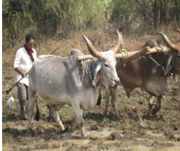
Puddling of field by farmers