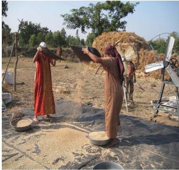
Farmer cleaning paddy Harvested from SIRA Plot