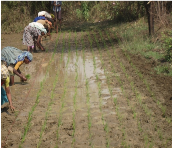
Transplanting of paddy by farmers