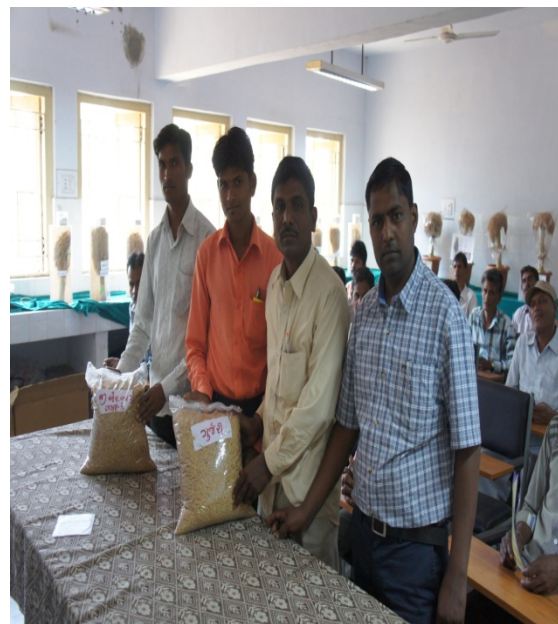
Paddy seed distributed to farmers